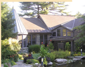
Founders Hollow Accord, NY