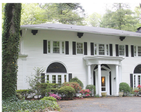
Meribah Muttontown, NY