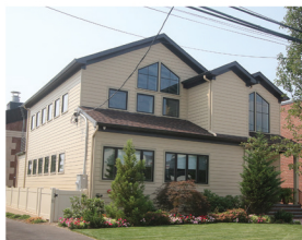
Saragossa Mineola, NY